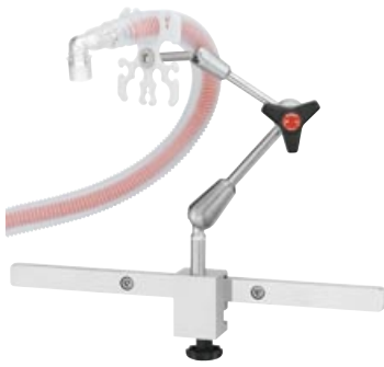
Breathing circuit holder Art. No. 3628.12 (Picture) Art. No. 3640.10

For additional information on standard sets please visit www.fisso.com .