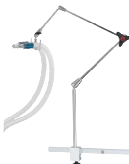
Respiratory circuit holder Art. No. 3670.15 (Picture) Art. No. 3690.15 Art. No. 3670.24 Art. No. 3670.60 Art. No. 4670.10