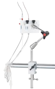
Pressure transducer plate holder Art. No. 3628.70 (Picture) Art. No. 3640.50